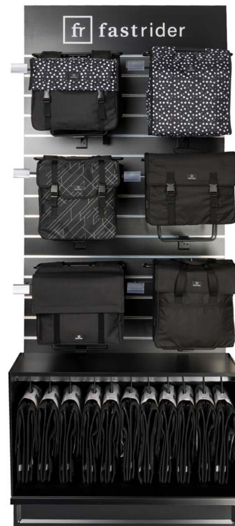
Dot · Dex · Ivan · Nore · Lasse