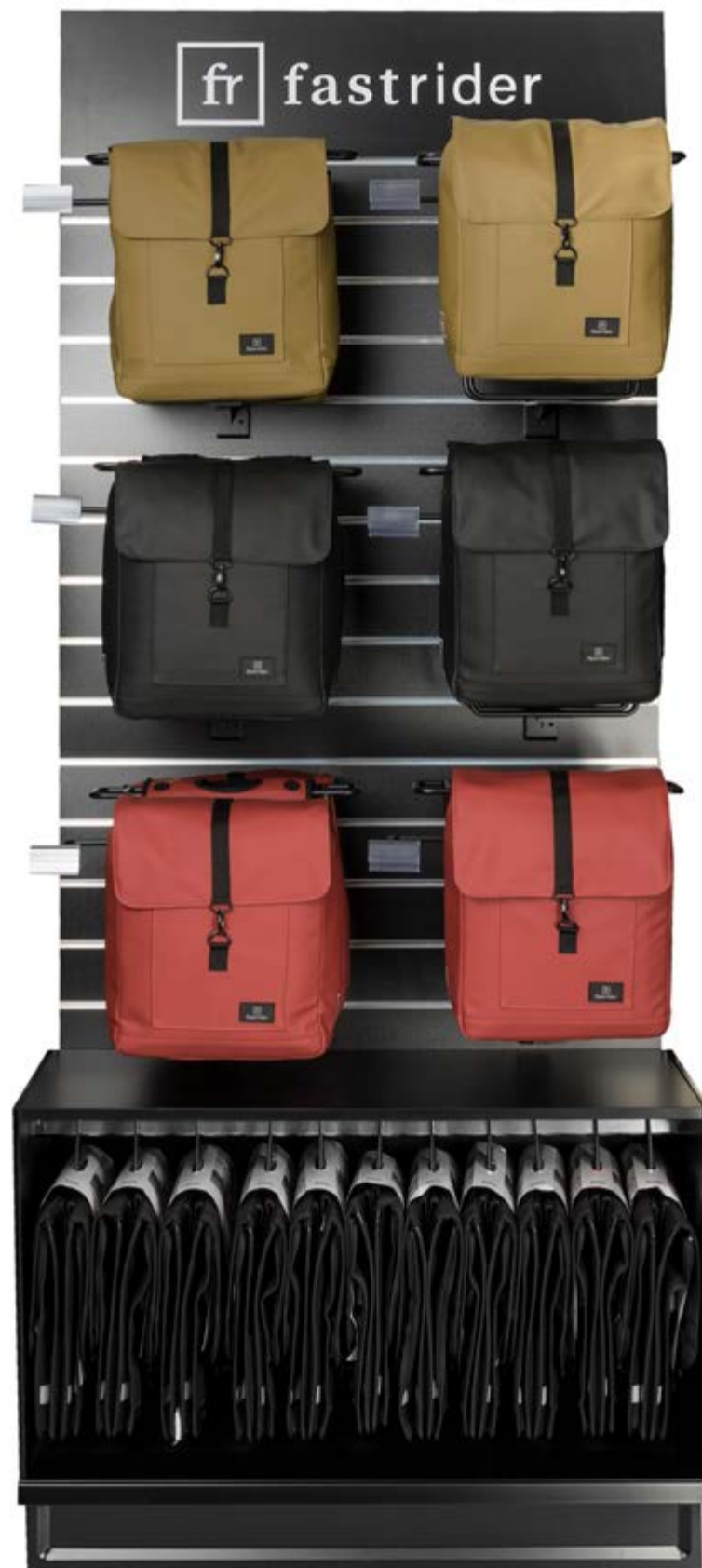
Jaxx II Basics