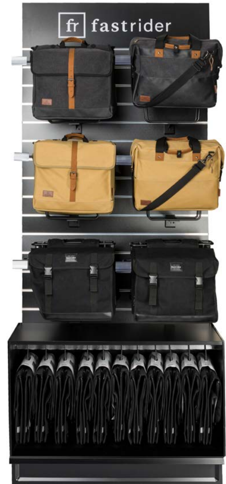
Canvas Trend / Basics