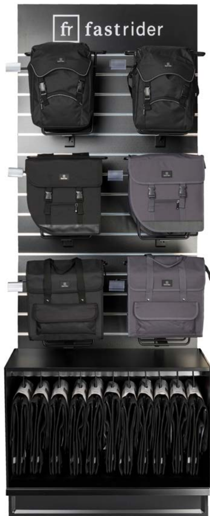
Unibag Traffic · Bodyl Hybrid · Lasse